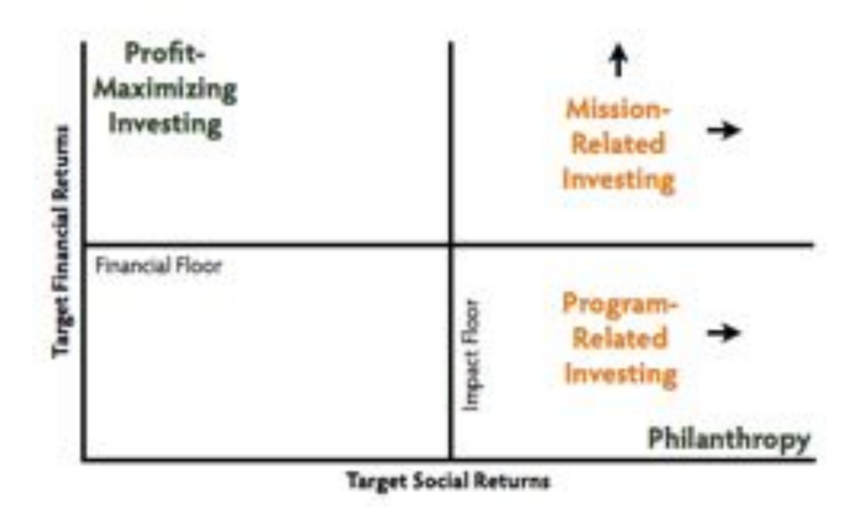
Figure 1: Comparing "Financial First" and "Impact First" Investors (Adapted from Monitor 2006; 2010)

In the words of one foundation official "There is an idea that values are divided between the financial and the societal, but this is a fundamentally wrong way to view how we create value . . . The world is not divided into corporate bad guys and social heroes" (Rockefeller, 2008, p. 13). The advent of mission-related investing, therefore, illustrates a trend toward foundations steadily rejecting outdated "two pocket" models of philanthropy – or when financial resources are managed in isolation from solutions-focused grantmaking – in favor of an integrated, holistic strategy whereby improving lives and improving bottom lines become one and the same.